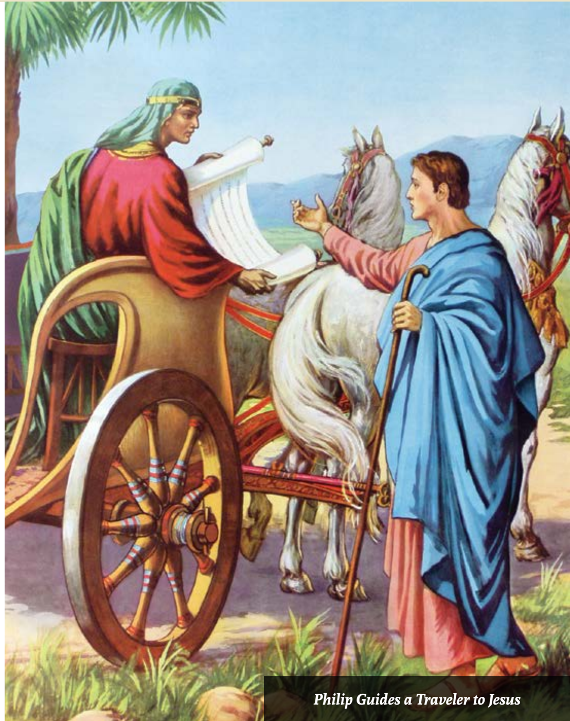
Philip Guides a Traveler to Jesus

H ave you ever been lost? In order to find your way back to familiar places, you need someone to give you directions. In a similar way, many have wandered away from the right path spiritually, and some have never been on it to begin with. Jesus said, “I am the way, the truth, and the life: no man cometh unto the Father, but by me” (John 14:6). By pointing others to Jesus, you help them to find the truth and the way of life. Through sharing God’s Word, you give them answers for difficult situations and decisions. You can also guide others in the right direction by staying on the right path yourself. When they see you not only talking about memorizing Scripture but also doing it with joy and success, they will be encouraged to follow your example.